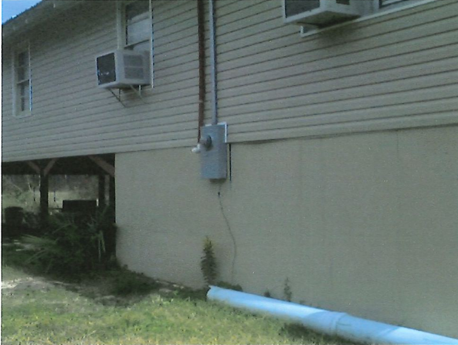
Meter Box at 3.8 NGVD 29