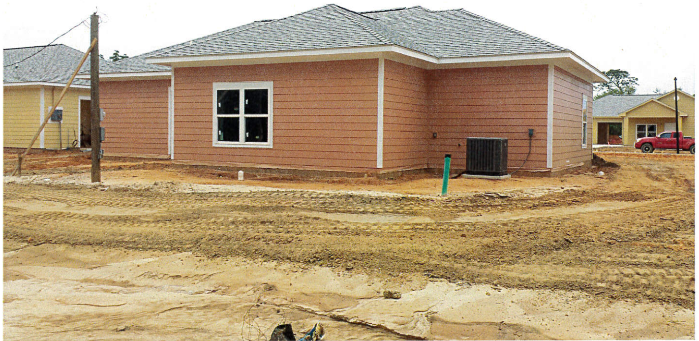
Rear view 05/09/2016

If submitting more photographs than will fit on the preceding page, affix the additional photographs below. Identify all photographs with: date taken; "Front View" and "Rear View"; and, if required, "Right Side View" and "Left Side View." When applicable, photographs must show the foundation with representative examples of the flood openings or vents, as indicated in Section A8.