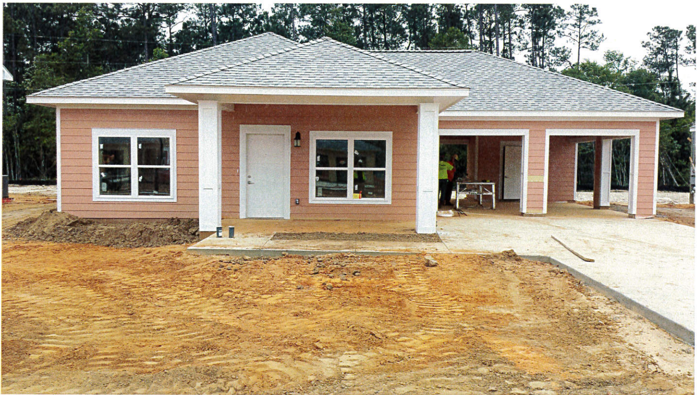
Front view 05/09/2016

If using the Elevation Certificate to obtain NFIP flood insurance, affix at least 2 building photographs below according to the instructions for Item A6. Identify all photographs with date taken; "Front View" and "Rear View"; and, if required, "Right Side View" and "Left Side View." When applicable, photographs must show the foundation with representative examples of the flood openings or vents, as indicated in Section A8. If submitting more photographs than will fit on this page, use the Continuation Page.