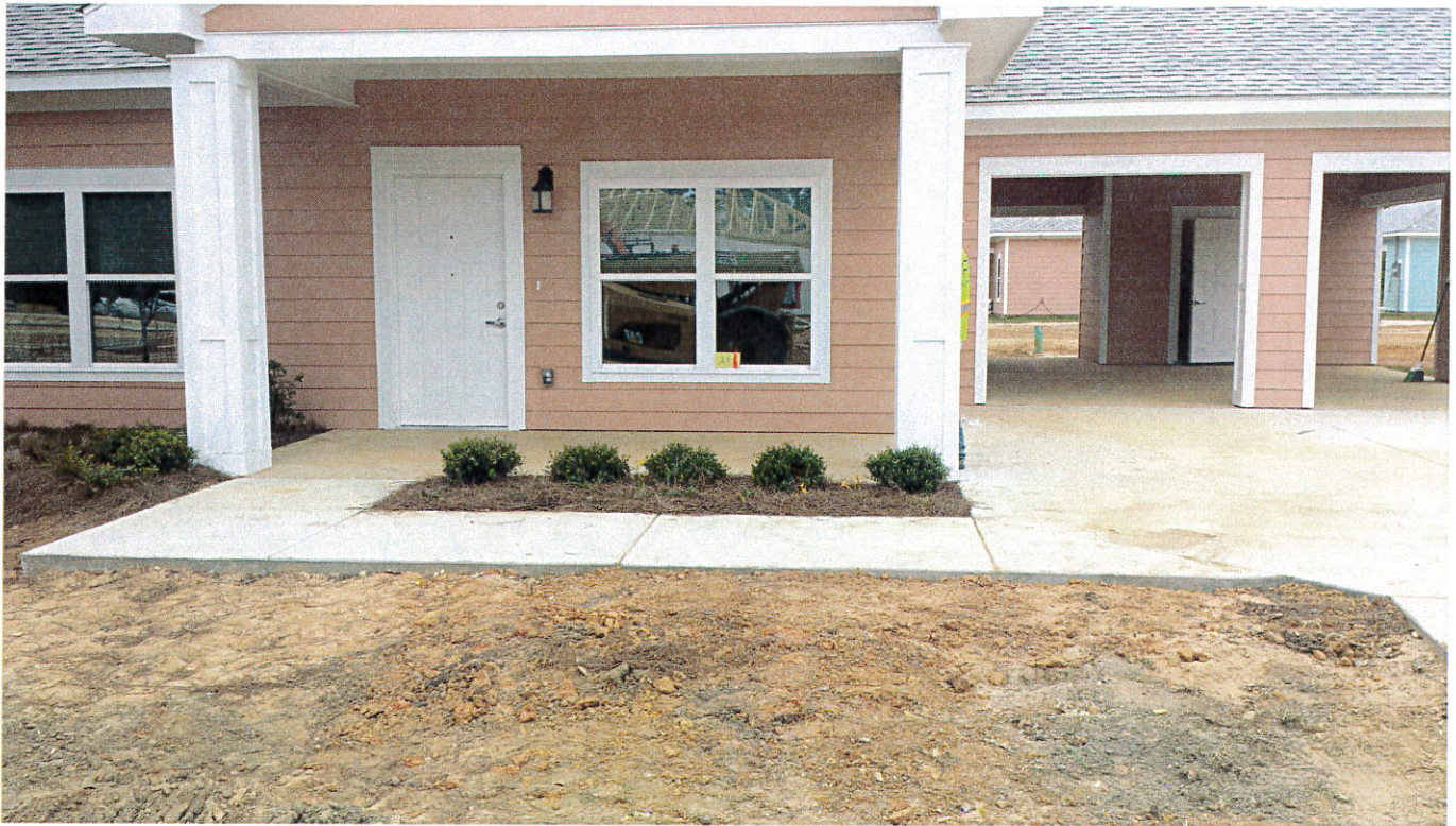
Front view 05/09/2016

If using the Elevation Certificate to obtain NFIP flood insurance, affix at least 2 building photographs below according to the instructions for Item A6. Identify all photographs with date taken; "Front View" and "Rear View"; and, if required, "Right Side View" and "Left Side View." When applicable, photographs must show the foundation with representative examples of the flood openings or vents, as indicated in Section A8. If submitting more photographs than will fit on this page, use the Continuation Page.