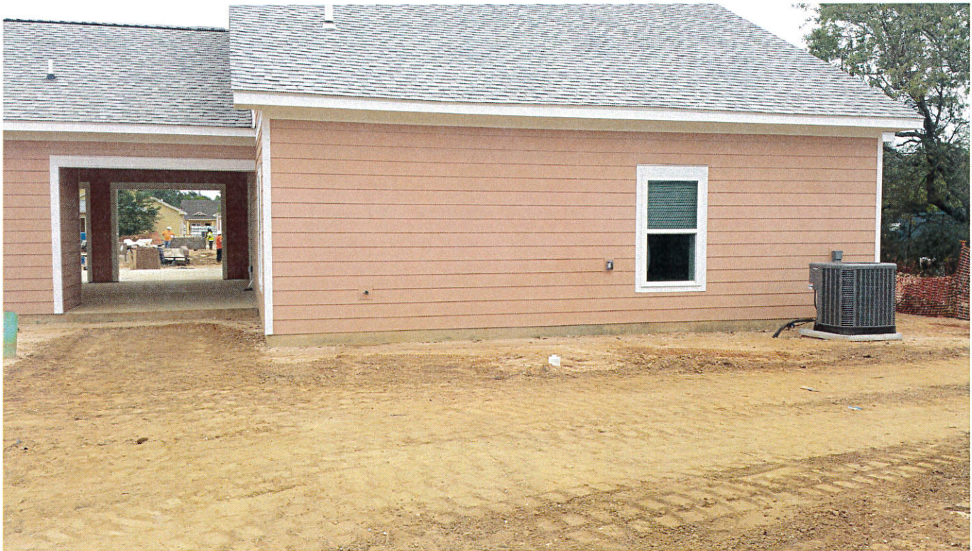
Rear view 05/09/2016

If submitting more photographs than will fit on the preceding page, affix the additional photographs below. Identify all photographs with: date taken; "Front View" and "Rear View"; and, if required, "Right Side View" and "Left Side View." When applicable, photographs must show the foundation with representative examples of the flood openings or vents, as indicated in Section A8.