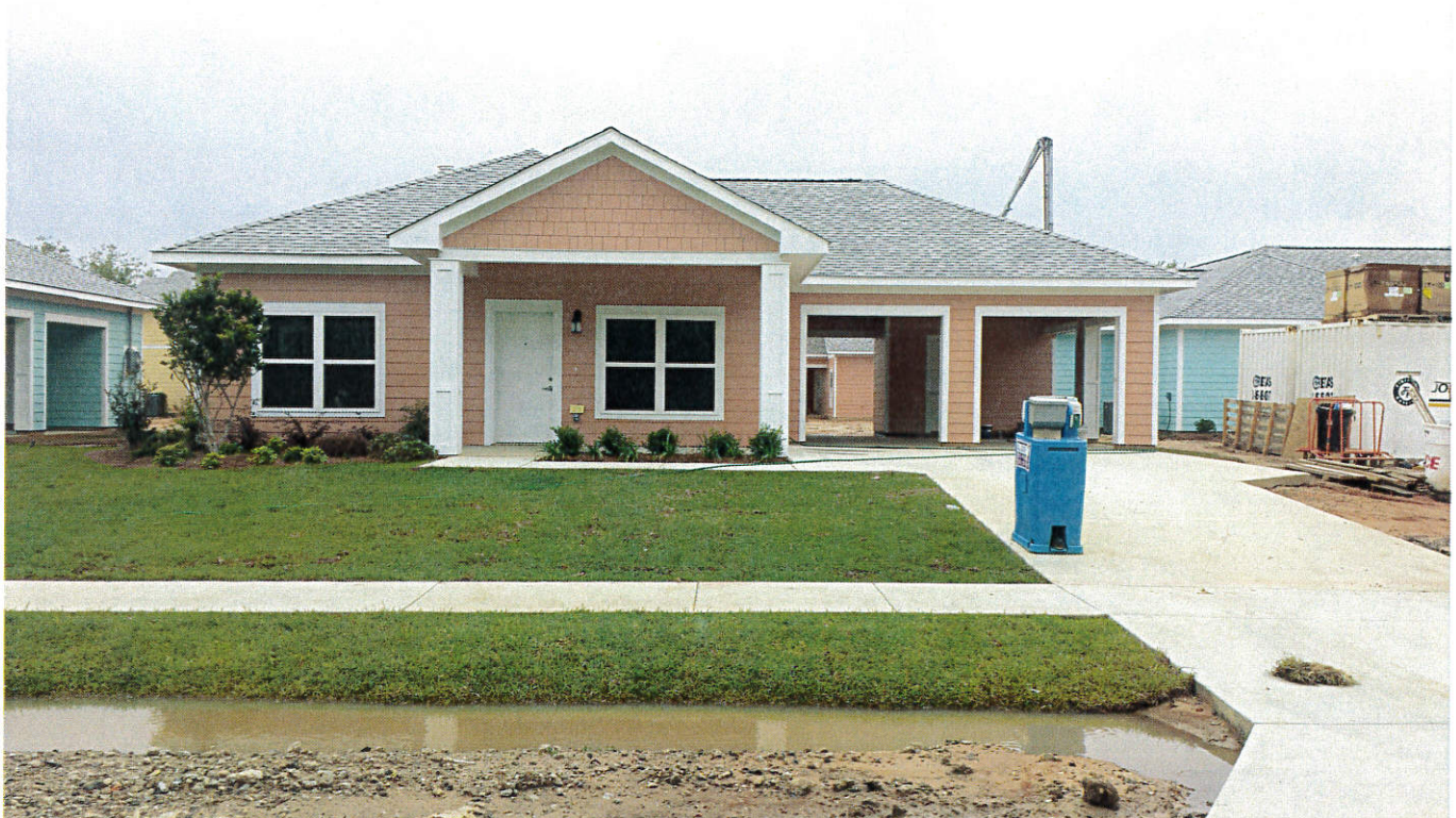
FRONT VIEW 04/28/2016

If using the Elevation Certificate to obtain NFIP flood insurance, affix at least 2 building photographs below according to the instructions for Item A6. Identify all photographs with date taken; "Front View" and "Rear View"; and, if required, "Right Side View" and "Left Side View." When applicable, photographs must show the foundation with representative examples of the flood openings or vents, as indicated in Section A8. If submitting more photographs than will fit on this page, use the Continuation Page.