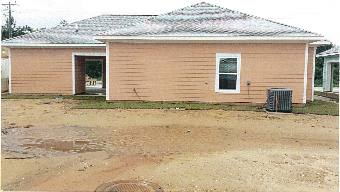
REAR VIEW 04/28/2016

If submitting more photographs than will fit on the preceding page, affix the additional photographs below. Identify all photographs with: date taken; "Front View" and "Rear View"; and, if required, "Right Side View" and "Left Side View." When applicable, photographs must show the foundation with representative examples of the flood openings or vents, as indicated in Section A8.