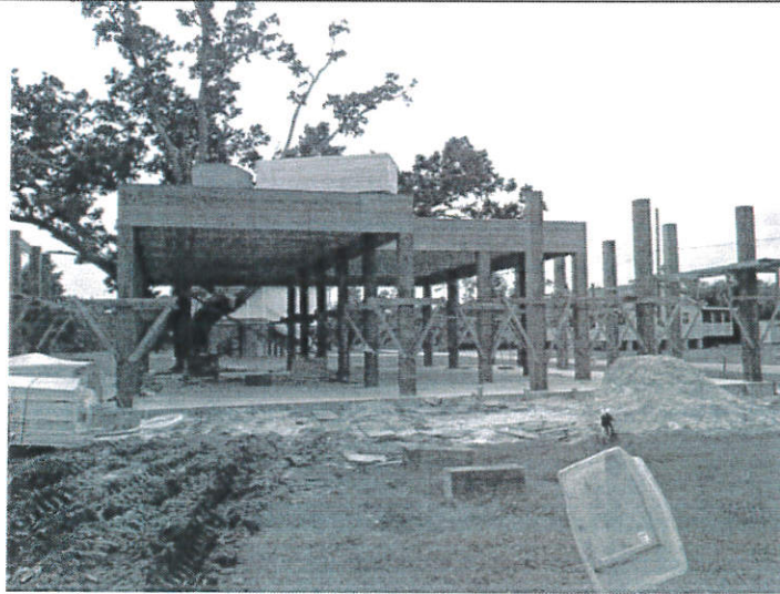
08/16/16 Front View Only

If using the Elevation Certificate to obtain NFIP flood insurance, affix at least 2 building photographs below according to the instructions for Item A6. Identify all photographs with date taken; "Front View" and "Rear View"; and, if required, "Right Side View" and "Left Side View." When applicable, photographs must show the foundation with representative examples of the flood openings or vents, as indicated in Section A8. If submitting more photographs than will fit on this page, use the Continuation Page.