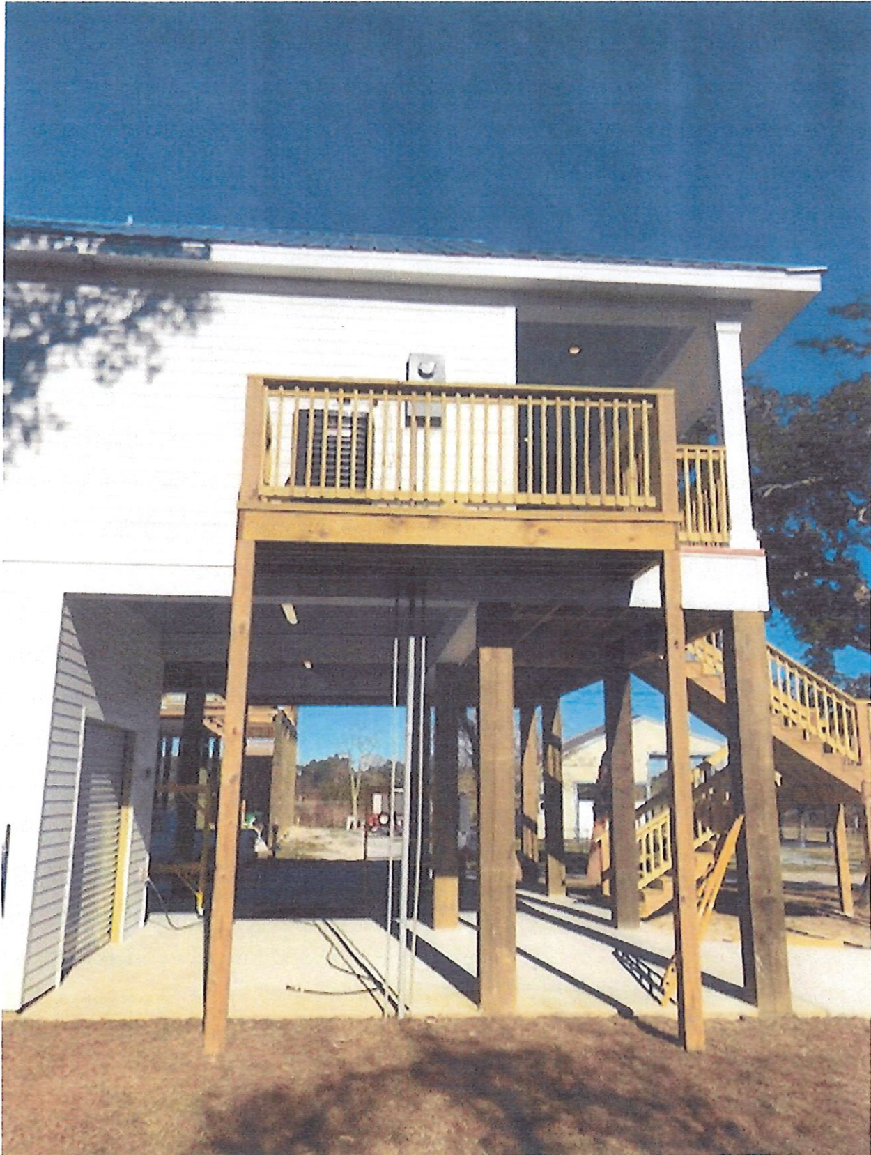
Photo 011119. Lowest Horizontal Structural Member = 24.1 Ft NAVD 88 AC Unit at 25.1 NAVD 88 and is in compliance