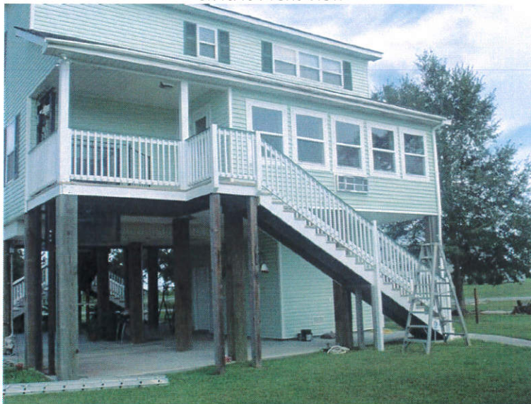
07/13/15 Rear View