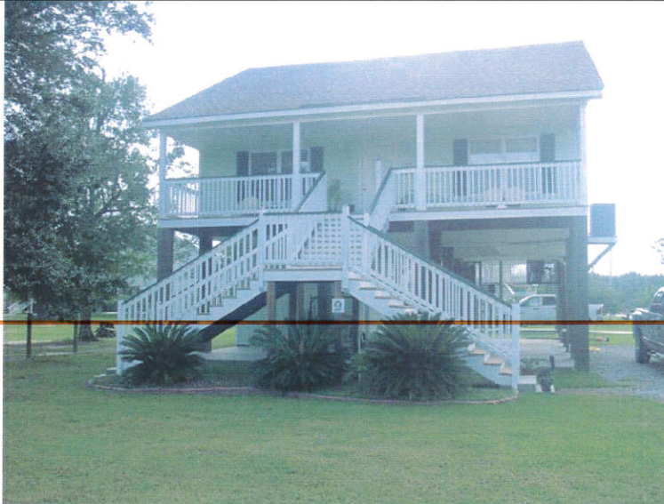
07/13/15 Front View

If using the Elevation Certificate to obtain NFIP flood insurance, affix at least 2 building photographs below according to the instructions for Item A6. Identify all photographs with date taken; "Front View" and "Rear View"; and, if required, "Right Side View" and "Left Side View." When applicable, photographs must show the foundation with representative examples of the flood openings or vents, as indicated in Section A8. If submitting more photographs than will fit on this page, use the Continuation Page.