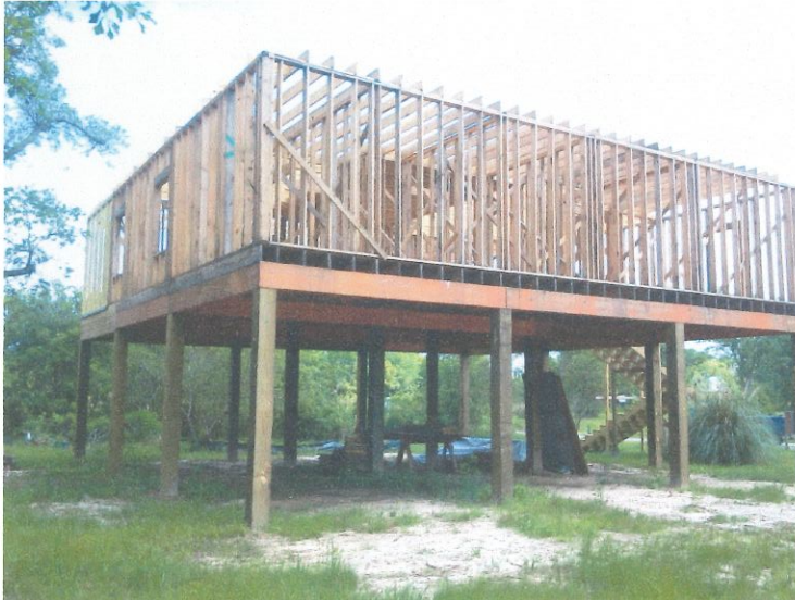
04/22/16 Rear & Right View