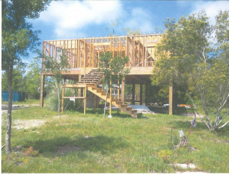
04/22/16 Front View

If using the Elevation Certificate to obtain NFIP flood insurance, affix at least 2 building photographs below according to the instructions for Item A6. Identify all photographs with date taken; "Front View" and "Rear View"; and, if required, "Right Side View" and "Left Side View." When applicable, photographs must show the foundation with representative examples of the flood openings or vents, as indicated in Section A8. If submitting more photographs than will fit on this page, use the Continuation Page.