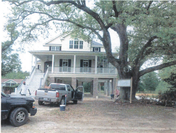
04/27/16 Front View

If using the Elevation Certificate to obtain NFIP flood insurance, affix at least 2 building photographs below according to the instructions for Item A6. Identify all photographs with date taken; "Front View" and "Rear View"; and, if required, "Right Side View" and "Left Side View." When applicable, photographs must show the foundation with representative examples of the flood openings or vents, as indicated in Section A8. If submitting more photographs than will fit on this page, use the Continuation Page.