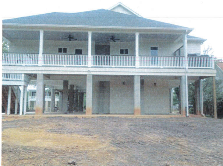
04/27/16 Rear View