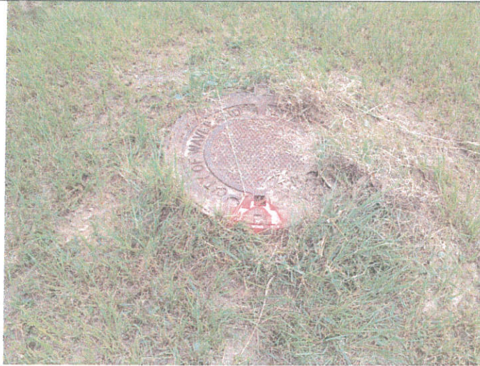
TBM View From Street

If using the Elevation Certificate to obtain NFIP flood insurance, affix at least 2 building photographs below according to the instructions for Item A6. Identify all photographs with date taken; "Front View" and "Rear View"; and, if required, "Right Side View" and "Left Side View." When applicable, photographs must show the foundation with representative examples of the flood openings or vents, as indicated in Section A8. If submitting more photographs than will fit on this page, use the Continuation Page.