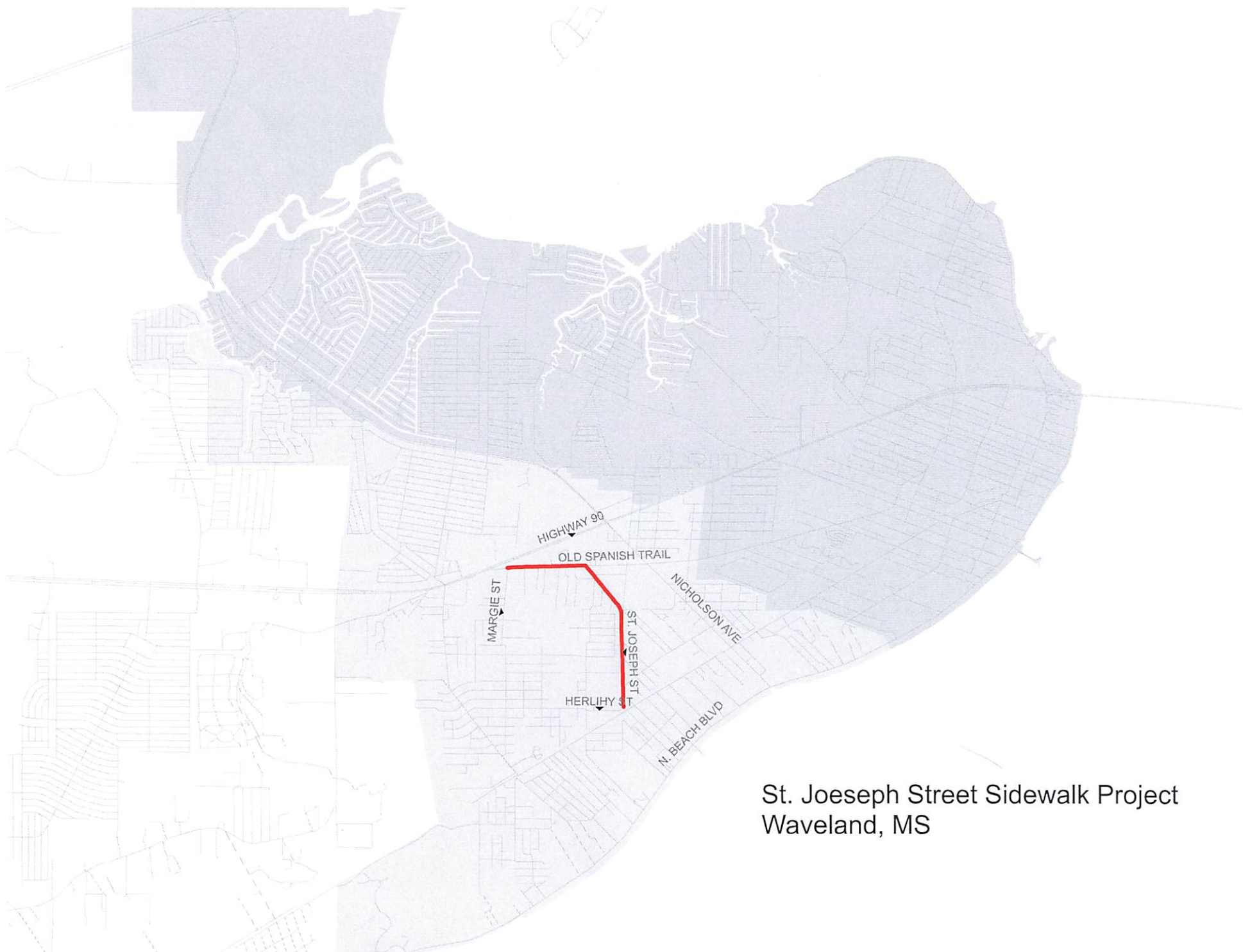
St. Joseph Street Sidewalk Project Waveland, MS